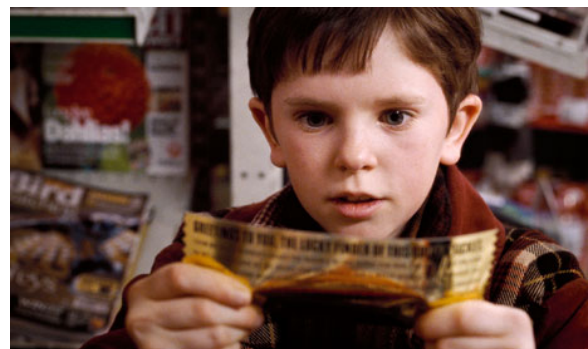
Charlie Bucket with his golden ticket.

On the 1 st February, the cheerful five children are visiting the famous and ingenious Mr Willy Wonka's amazing forbidden factory and home, to discover his so long, hidden secrets. The crazy chocolate hunt is finally after weeks and weeks of wacky unwrapping is definitely over. The five wonders have been uncovered.